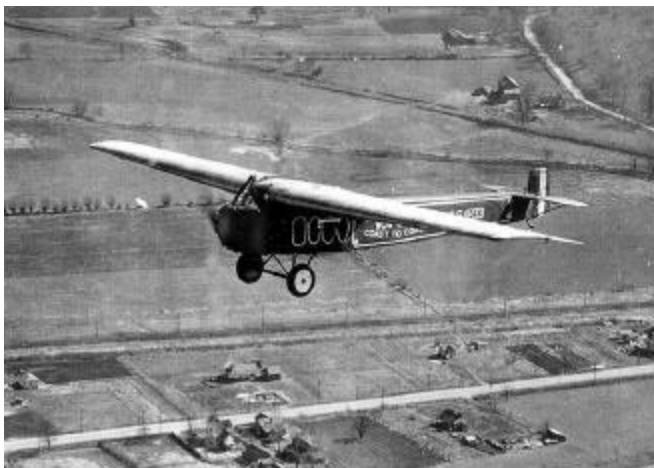
THE GIANT MONOPLANE "T-2" ON ITS RECORD-BREAKING, TRANSCONTINENTAL, NON-STOP FLIGHT